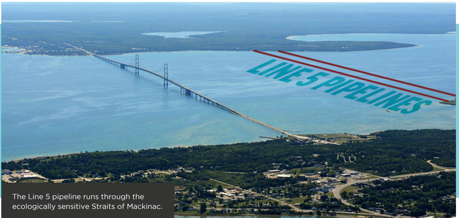
The Line 5 pipeline runs through the ecologically sensitive Straits of Mackinac.

The report also includes an assessment of the consumer impacts of one of the alternative scenarios to Line 5 and concludes that it would raise the price of gasoline by just 1.8 cents per litre.