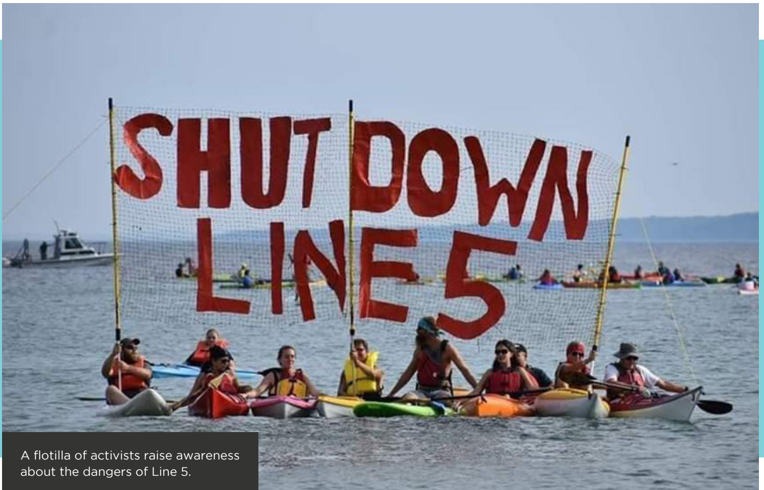
A flotilla of activists raise awareness about the dangers of Line 5.

We are now in what can be truly called a climate emergency. We have seen devastating natural disasters such as heat waves, forest fires, flooding, and intense storms occurring at a much greater frequency due to the impacts of human caused global warming. The Great Lakes and their many ecosystems are also seeing unprecedented changes occurring due to climate change impacts that will pose great challenges in the decades to come. The need to implement robust climate measures has never been more pressing.