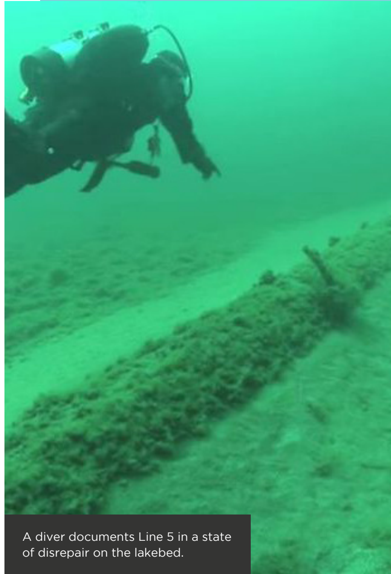
A diver documents Line 5 in a state of disrepair on the lakebed.

Enbridge's also has a poor track record when it comes to spills and spill response. In 2010, Line 6B ruptured into the Kalamazoo River resulting in over $1 billion in clean up costs. It took Enbridge 17 hours to shut down Line 6B. It wasn't even Enbridge that detected the spill — a local utility worker who smelled gas did. Line 5 is even older than Line 6B was at the time of the rupture. Line 5 is 69-years-old and Line 6B was 41-years-old when it ruptured. On top of this, between 2000-2014 alone, there have been over 1,276 spills across the entire Enbridge