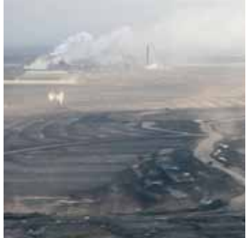
By June 2009, tar sands mining operations had destroyed an area of the Boreal forest one and half times the size of Denver, Colorado.