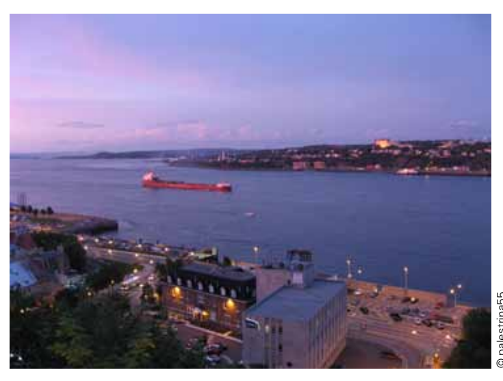
The Trailbreaker pipeline crosses the Saint Lawrence River, which provides drinking water for nearly 50 percent of Quebec's population.