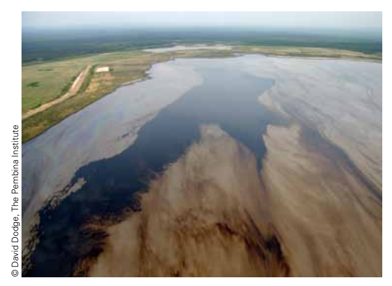
Toxic tailings ponds created by tar sands mining operations cover an area the size of Vancouver or Washington, D.C.