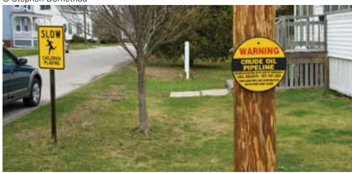
The Portland-Montreal pipeline flows underground through dozens of communities throughout New England and Central Canada.