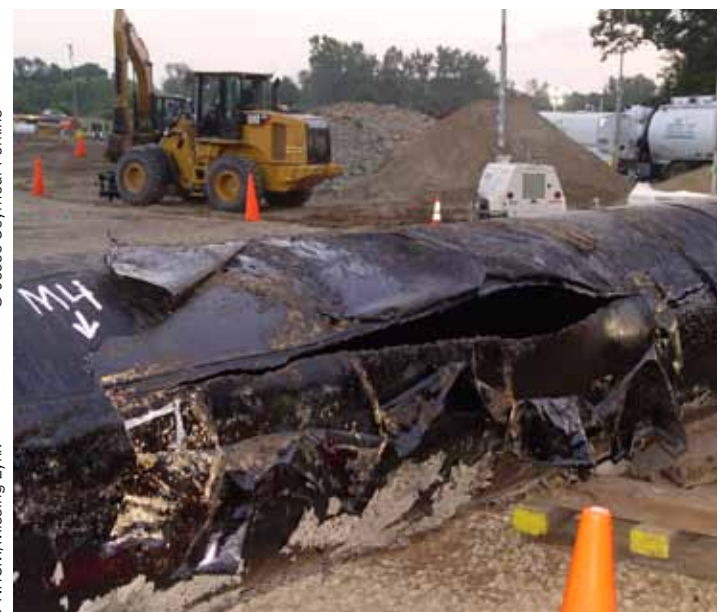
In 2010, a rupture in an Enbridge Inc. pipeline near Marshall, Michigan resulted in the largest tar sands spill in U.S. history.